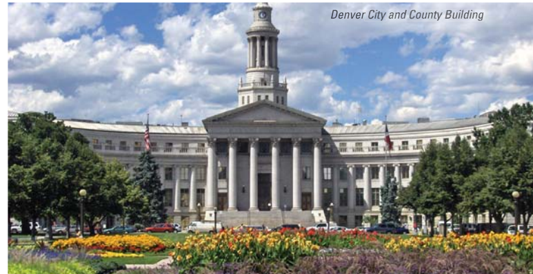
Denver City and County Building

Co-sponsored by the Association of American Law Schools ADR Section, The Legal Educators Colloquium brings together academics, adjuncts and teachers from many disciplines to discuss pedagogy and learn from each other. The afternoon "Shoptalk" program provides an opportunity for discussion and dialogue.